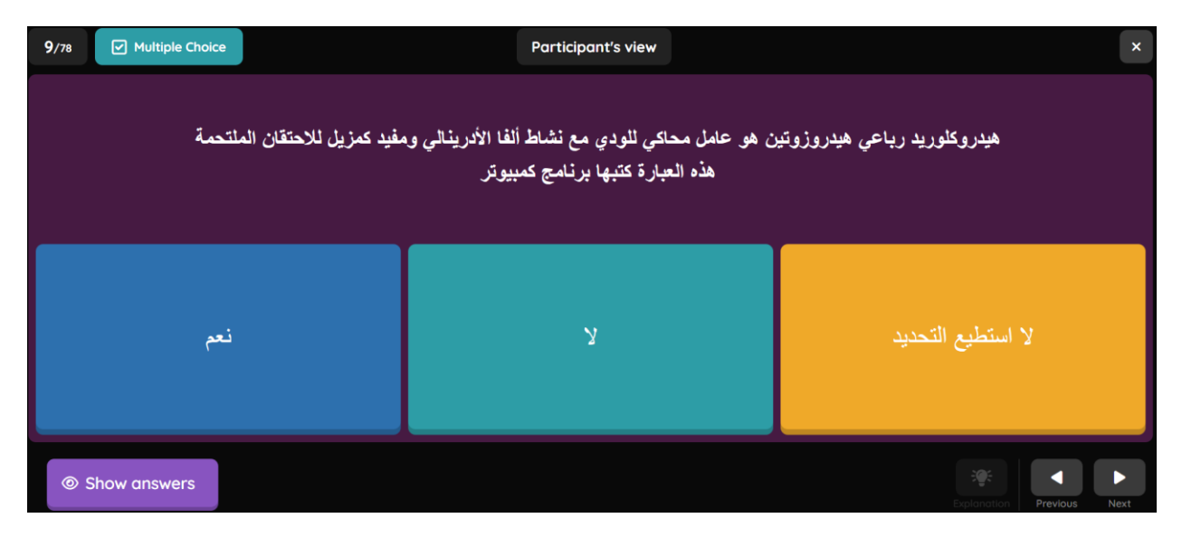
Figure 1: A Screenshot from the Online Survey

Journal of English and Comparative Studies