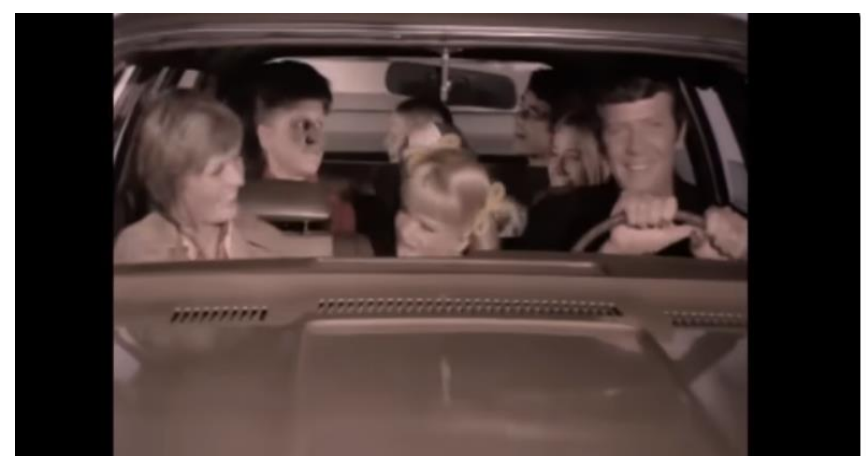
Figure 6: Image/sound coherence errors example 2

foreign, which is not present in the ST. Therefore, it erroneously substitutes the noun \overline{l}(\underline{e}) which is already omitted and translated as a part of the previous sentence preceded by a preposition . This rendition conveys deceitful TT contextual meaning, falsely implying that the four boys are foreigners.