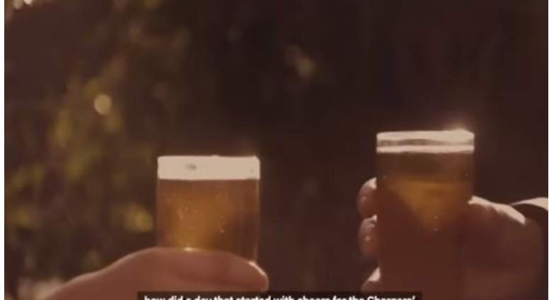
Figure 5: Image/sound coherence errors example 1

The three videos display overall coherence between the original image/sound and the CCs. However, there are some deviations from such unity like: