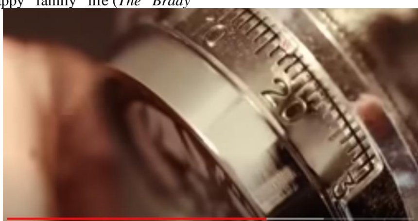
Figure 7: Image/sound coherence errors example 3

Inconsistency between lexemes and images can be detected in the CC example Legere entered the church and crept around in the dark looking for anything valuable to steal discovering a safe ودخل إلى الكنيسة وتسلل ودخل إلى الكنيسة وتسلل في الظلام بحثاً عن أي شيء ثمين لسرقته ليكتشف مكاناً in this criminal context, the erroneous