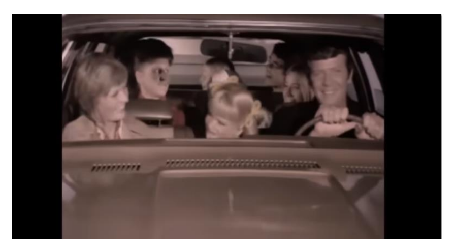
Figure 6: Image/sound coherence errors example 2

foreign, which is not present in the ST. Therefore, it erroneously substitutes the noun أرواح which is already omitted and translated as a part of the previous sentence preceded by a preposition من الأجائب. This rendition conveys deceitful TT contextual meaning, falsely implying that the four boys are foreigners.