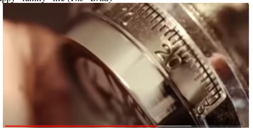
Figure 7: Image/sound coherence errors example 3

Bunch, n.d.). It is thus untenably translated into مجموعة البطلين, exhibiting stark inconsistency with the visual semiotic level of a happy family riding in a car, which can be translated into "نموذج العائلة السعيدة" for instance.