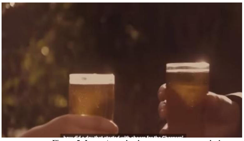
Figure 5: Image/sound coherence errors example 1

The three videos display overall coherence between the original image/sound and the CCs. However, there are some deviations from such unity like: