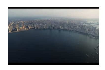
Frame 6 Frame 7 Frame 8