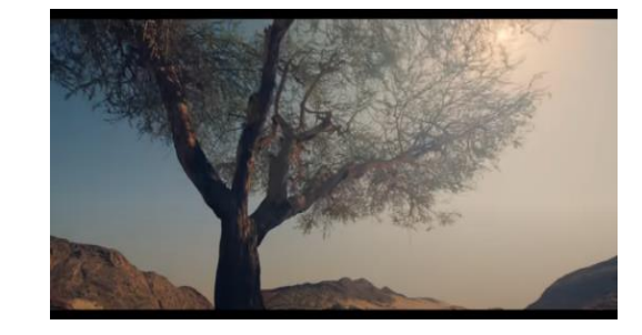
Frame 9 Frame 10