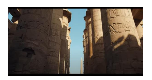
Frame 4 Frame 5