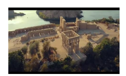
Frame 2 Frame 3