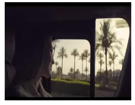
e 35 Frame 36