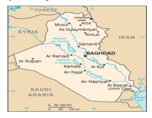
Figure 1: The Southern Provinces https://en.citizendium.org/wiki/Provinces_of_Iraq

both Iran and Kuwait have been critical aspects of stigmatization: