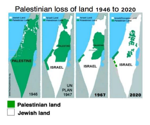
Figure 4 https://www.passblue.com/2020/02/03/will-trumps-vision-shake-up-the-middle-east/

How has Palestine disappeared geographically from the maps? Forced exile from homeland and the mapping away of the Palestinian lands have been culminated in the American President Trump's 'Plan of the Century' in 2020: