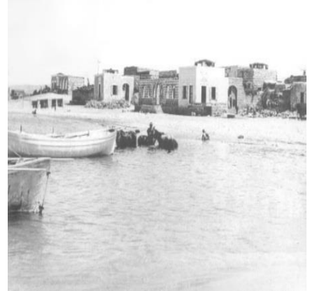
Figure 5: Front Cover Design (2010) - Tantoura in 1935 during the British Mandate https://ar.wikipedia.org/wiki

Rugaya's sensory memories of the city sea's color, smell and warmth represent the "sensation of presencing" (Moslund 29; emphasis in the original). The textual signifiers usher a topopoetic appreciation of Tantoura's coastal shore, hence, the "sense energies" (Deleuze and Guattari 166) of the physical experience of the city sea provoke "intensive states" (Deleuze 141) within the memoirist's geomental sensuous experiences. Rugaya nostalgically speculates, "The sea in Beirut or Alexandria is the same sea. City sea is different: you look at it from a higher balcony or you walk along an asphalt path and the sea is there, separated from you by a ditch and fence" (Ashur 2014: "Langscaping" 16). Ruqaya's (Tally, Geocritical Exploration beautifully 4)