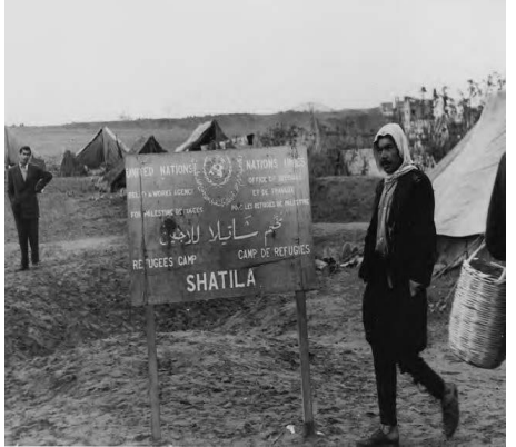
Figure 8: Refugees' camp in northern Lebanon & Shatila camp early 1950s

Despite the Israelis' tight control over the camps, they fail to erode "the practice of family solidarity or family reproduction. All accounts of the early period show the refugees groping to re-establish family contacts" (Sayigh 1979: 136). Camps, checkpoints and walled-in areas are seen as "open-air prisons" (Peteet xiii). The refugees suffer from the pressures and restraints