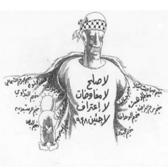
Figure 7: Naji Al-Ali's Drawings https://al-ain.com/article/naji-al-ali-bullet-handala / https://www.pinterest.com/pin

He is a ten-year-old boy depicted from the back with clasped hands and his eyes are only on the Palestinian predicament. It is a physical pose of opposition and rejection of